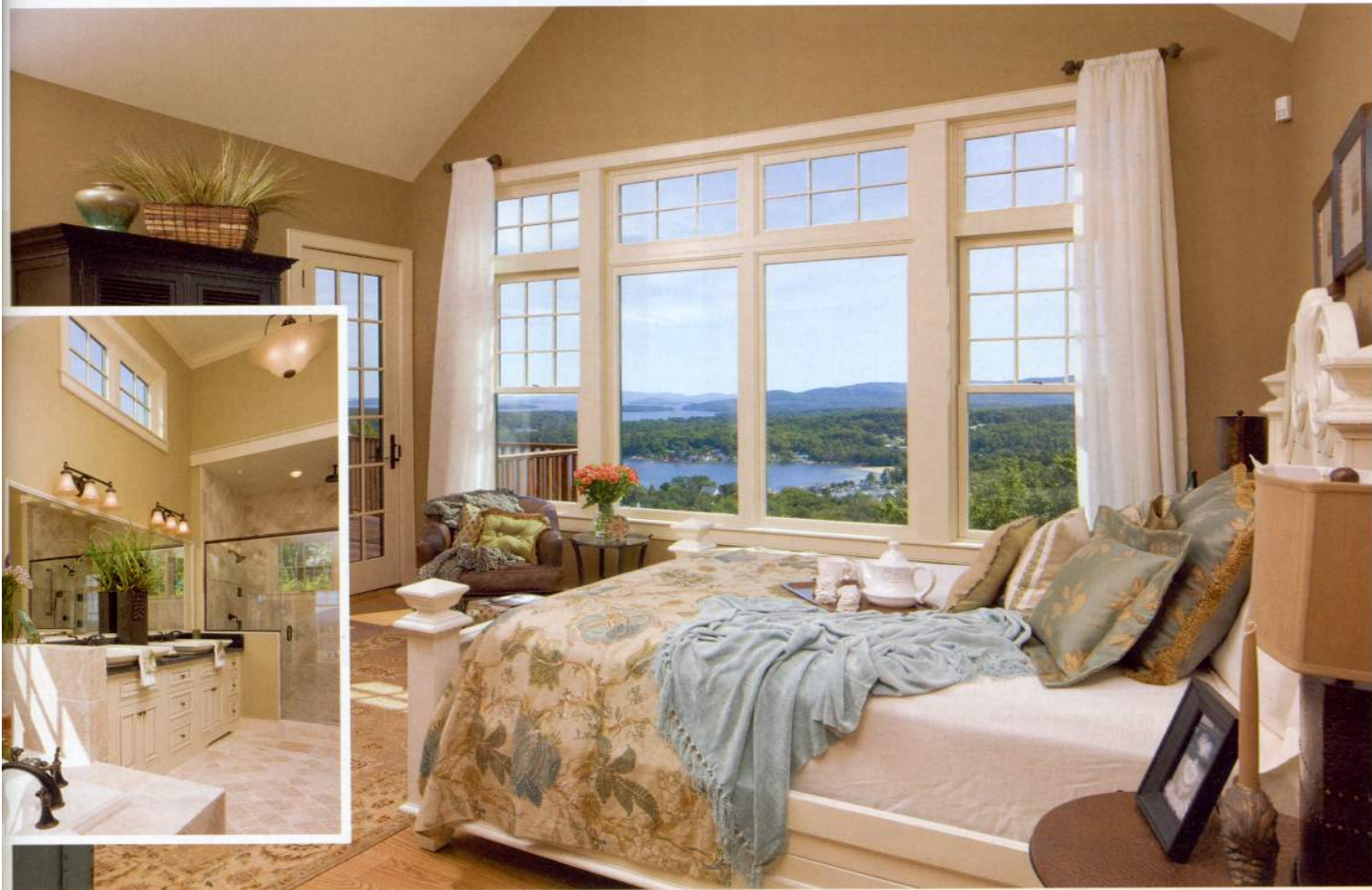
A palette of earthy colors and a cool blue creates serenity in the master bedroom, by Barbara Bernier of Barbara Bernier Interior Design, and sets off the room's stunning water views. She incorporated soft neutrals in her design of the elegant master bathroom (inset).

ing spaces—a hearth room and lodge room; an expansive kitchen and breakfast area with floor-to-ceiling windows overlooking the lake and mountains; and a master bedroom suite. Many of the rooms access a wraparound deck behind the home. The walkout downstairs level includes a game room, bar, wine cellar and home theater. Two bedrooms are situated on the second floor. Despite the house's rustic appeal, it has state-of-the-art wiring to accommodate various computer, audio and visual systems.