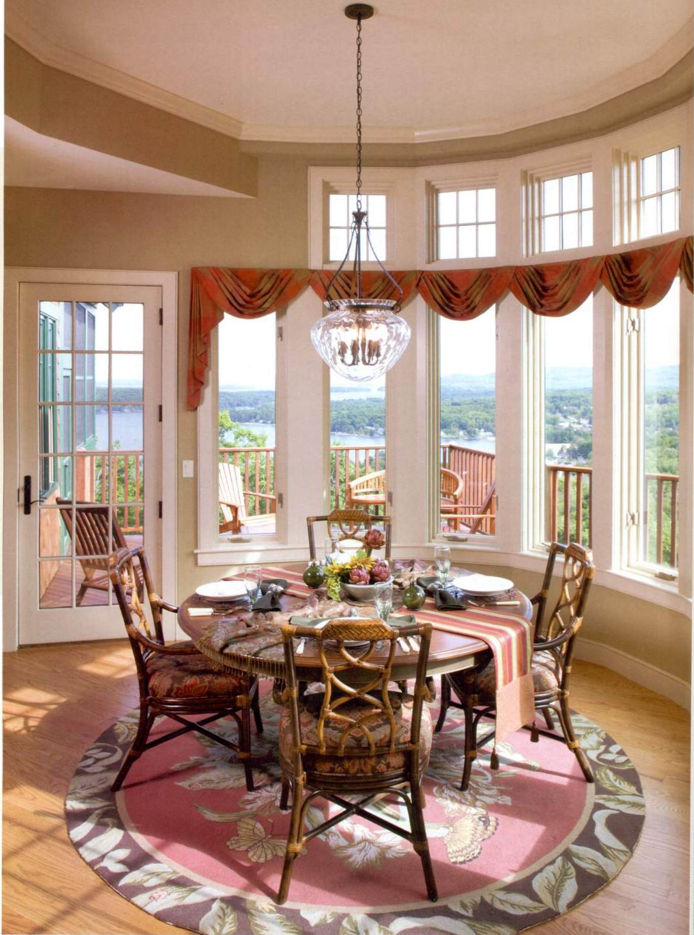
Julia Elizabeth Dias of Julia Dias Interiors used warm tones and classic furnishings to complement the views outside the breakfast nook.