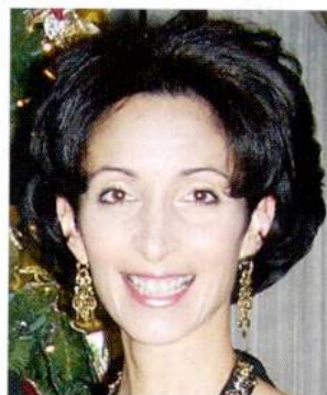
Julia Dias Interiors, LLC

Furnishings & Accessories: Bartlett Design/Home Studio