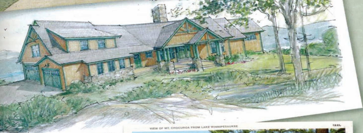
lake house high above the shores of Lake Winnepesaukee