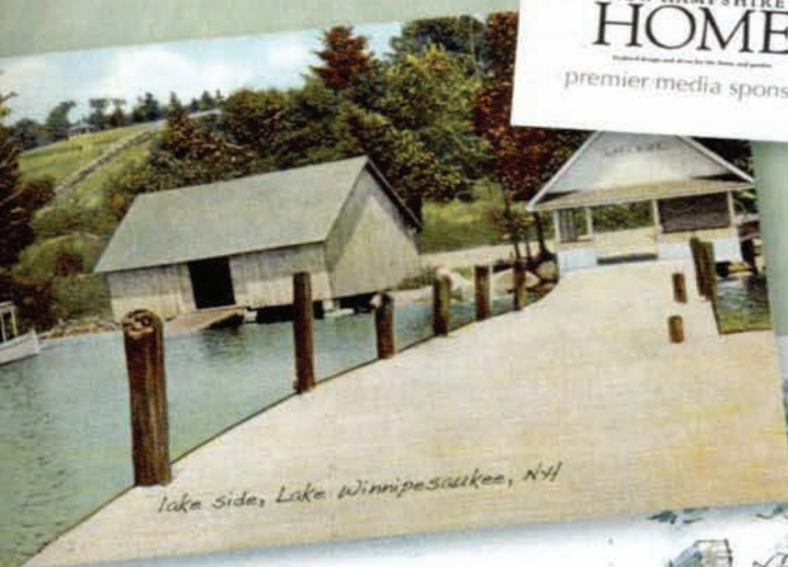
lake side, Lake Winnepesaukee, NH